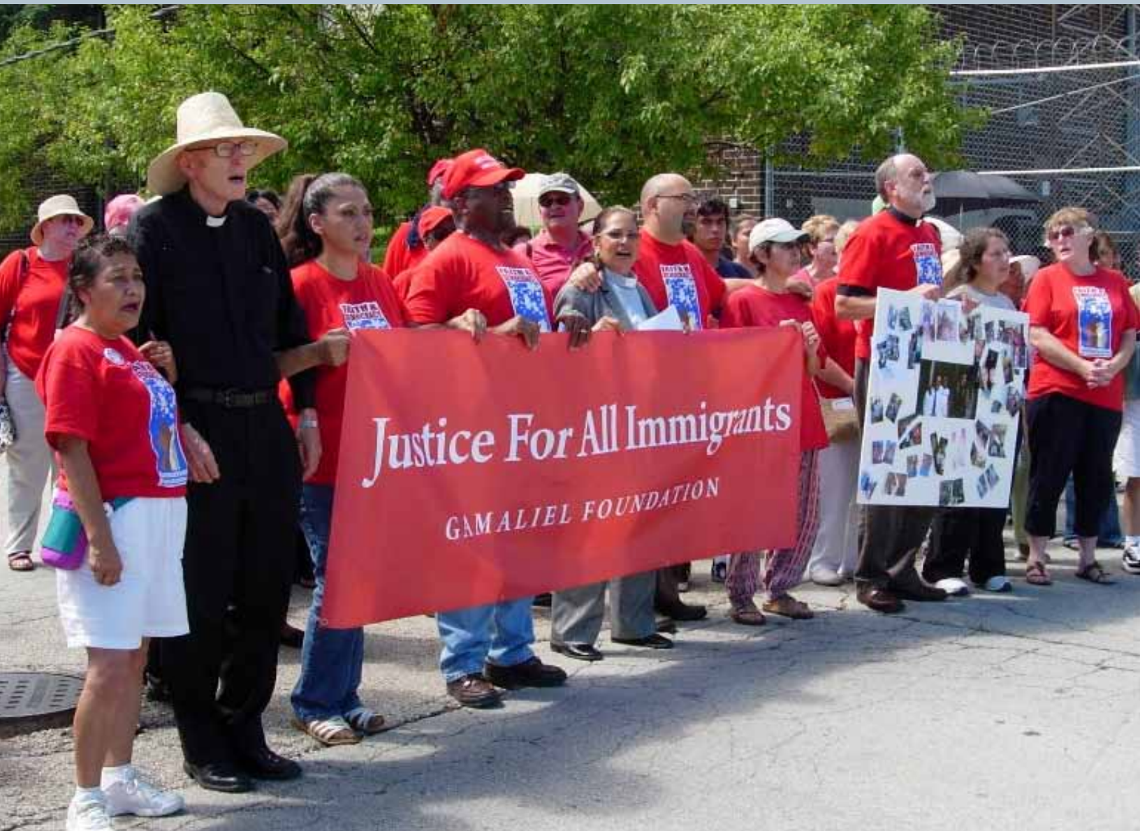
Gamaliel affiliates have held prayer vigils and actions outside the offices of 20 members of Congress, as well as at immigration detention centers around the country.