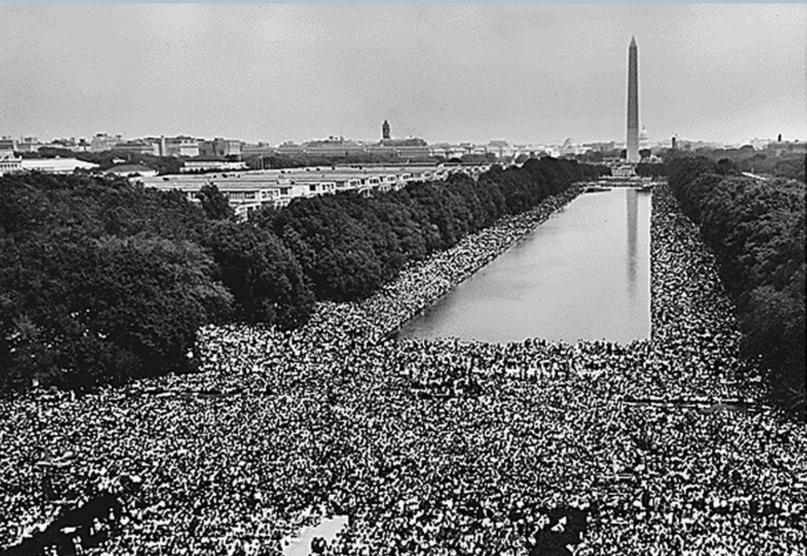
Hundreds of thousands of Americans gather on the National Mall in Washington, D.C., during the March on Washington for Jobs and Freedom on Aug. 28, 1963.