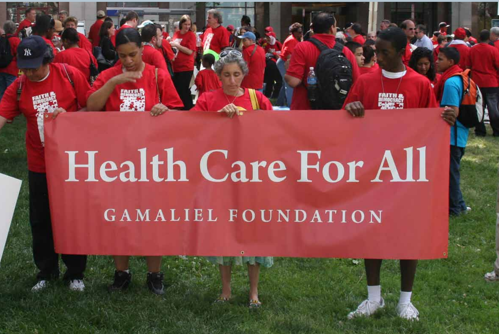
Gamaliel members from affiliates around the country rallied in Washington, D.C., in support of national health care reform in June 2009.