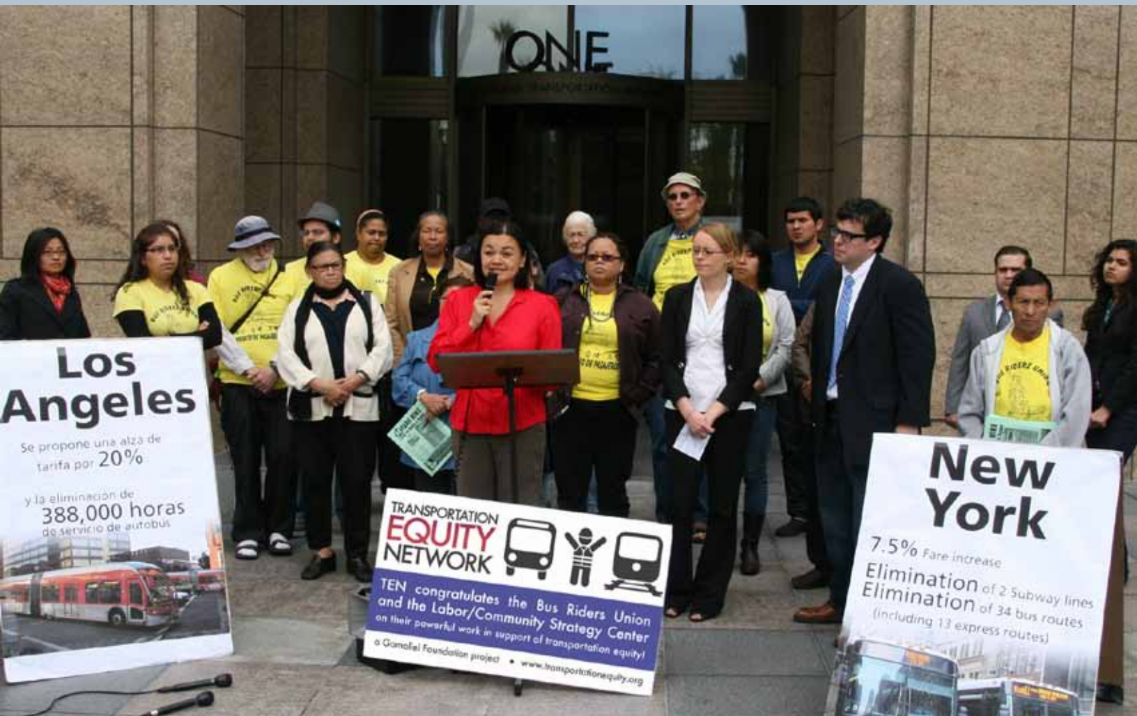
The Transportation Equity Network is holding coordinated National Days of Action to highlight transit service cuts and fare hikes—especially their effect on low-income people, people of color, older Americans, and Americans with disabilities.