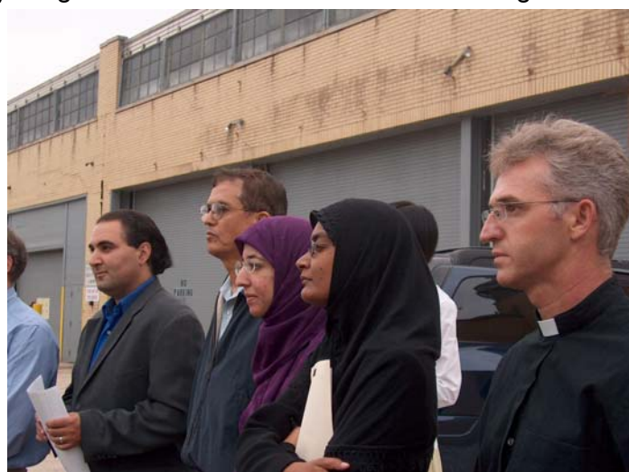
JUBILEE Elizabeth Detention Center Demonstration

The local Gamaliel affiliate in New Jersey is engaged in a campaign that seeks to close this warehouse and to pass laws that ensure fair and timely legal hearings and other measures of due process and humane treatment for detainees.