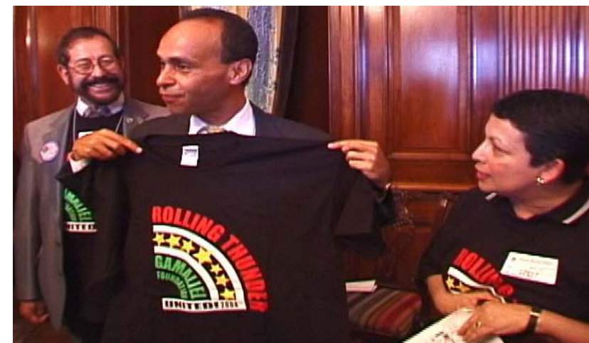
Gamaliel CRI leaders present Rolling Thunder shirt to Representative Gutierrez

Washington, D.C., May 4th, 2004, Senator Kennedy and Representative Gutierrez introduced the Solve Act, comprehensive immigration reform legislation that includes issues of legalization, family visas, and worker protections.